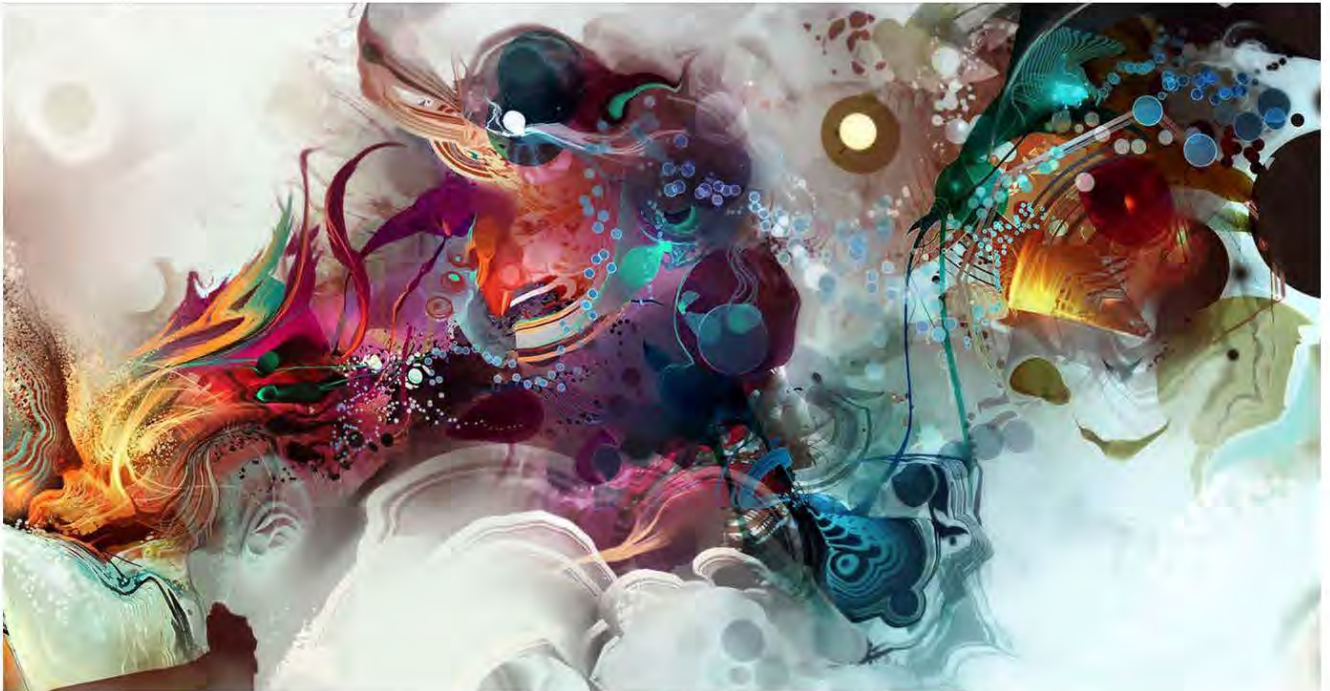
Figure 2; The original graphic design from a Japanese computer wallpaper creator

The TPS gave this offender an opportunity to discuss the grievance we had with the imagery and asked for an explanation. This was met with denial, anger, a threat of legal recourse and a tout of it being simply 'sour grapes' on our behalf. All of the offending creative composites were quickly removed from the group, by the offender. This is a common response from those who have been found out and caught dead-to-rights, no less.