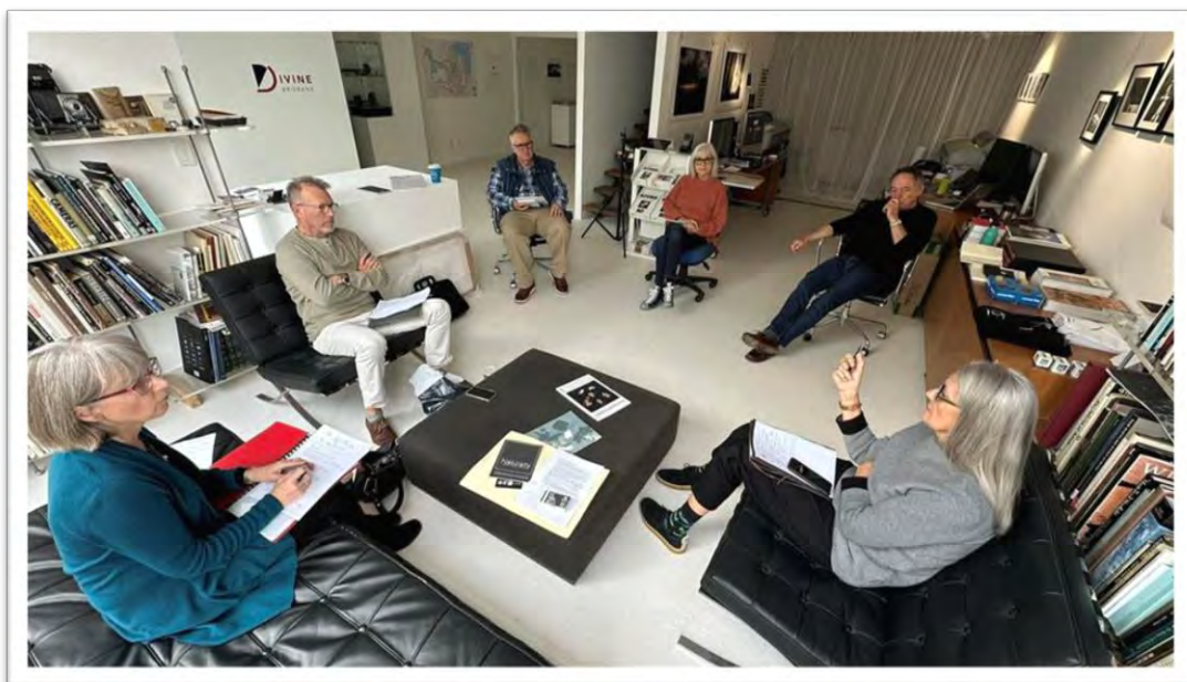
One of many Planning meetings

Further information regarding 'Naturally' contact The Queensland Camera Group or The Maud Street Photo Gallery website.